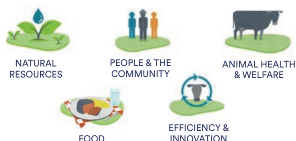
FIGURE 2. GRSB CORE PRINCIPLES 74

GRSB: There are 5 core principles identified, as displayed below. The GRSB also consists of allied national roundtables or initiatives, which now exist in over 20 countries 72 . However, a certification framework has so far only been developed in Canada 73 .