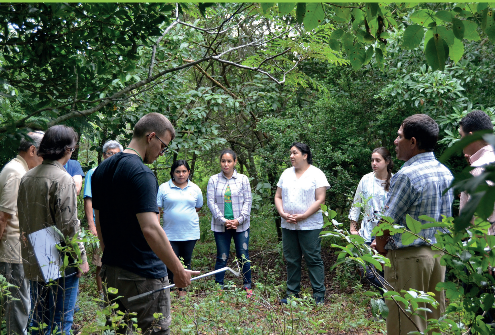
Participants in an ecosystem restoration course at the ecofarm. ↑

This initiative has received financial support from a diverse range of civil society organisations (CSO) and foundations. However, restrictive government policies relating to CSO finance have recently caused difficulties.