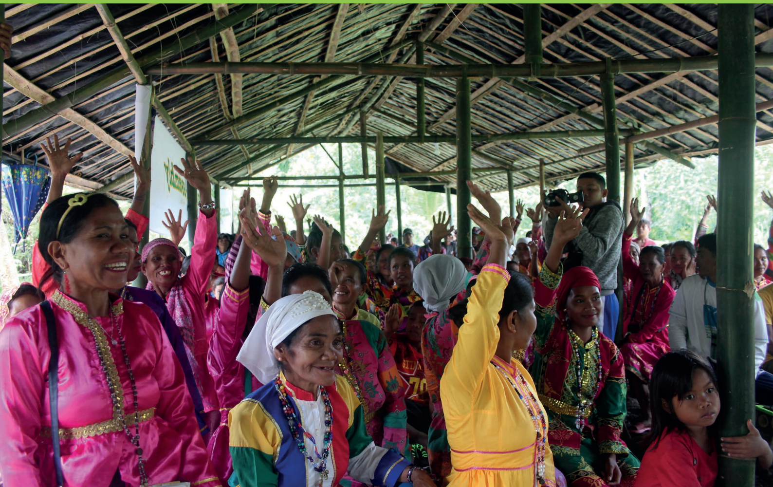
Participants at the first Lamangian assembly. ↑

Sulagad farming technique demonstrations and discussions have been held, including sulagad conferences at village level in five pilot areas, as well as one at the ancestral domain level. A demo farm is also being developed to allow communities to experience the benefits for themselves, and enable them to replicate the same practices in the future.