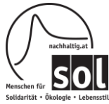
SOL – People for solidarity, ecology and lifestyle, Austria