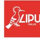
Lipu - BirdLife Italy