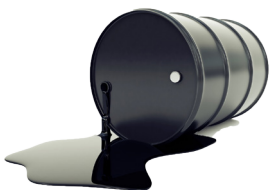
Savings on fossil fuel imports