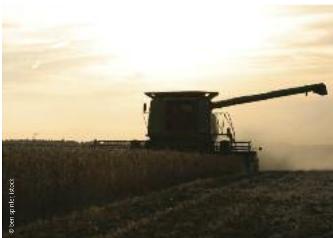
Harvesting of soy