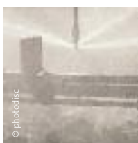
Left: Crop spraying. Right: Corn.

Overall, some of the energy saved from reducing the number of field operations is immediately lost by using more power per operation. Alternative approaches to crop production based on agro-ecological principles use nitrogen fixing plants, composts and manures together with crop rotation. This builds soil fertility, including by increasing the organic matter/carbon in the soil and increasing its moisture-holding capacity. These improvements in soil structure help reduce soil erosion and increase penetration of rainfall. Biodiversity also increases over time, which improves nutrient cycling and increases numbers of pest predators.