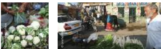
Left & Right: Market stands in Mandawa and Fatephur, Rajasthan, India.