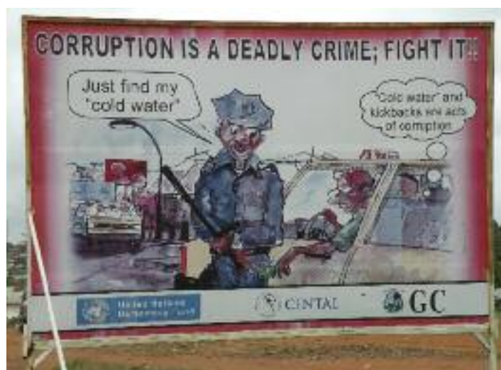
Corruption remains major problem in Liberia

We have assessed if this donation – and other aspects of ArcelorMittal’s performance – is in line with the OECD Guidelines for Multinational Enterprises. These guidelines are recommendations addressed by governments to multinational enterprises. They provide voluntary principles and standards for responsible business conduct consistent with applicable laws. The guidelines aim to ensure that the operations of these enterprises are in harmony with government policies, to strengthen the basis of mutual confidence between enterprises and the societies in which they operate, to help improve the foreign investment climate and to enhance the contribution to sustainable development made by multinational enterprises. 30