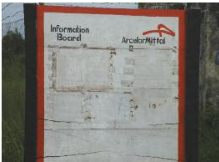
ArcelorMittal information board near company facilities in Buchanan in Grand Bassa County.

The company also managed the reconstruction work of the railroad from Buchanan to Yekepa. The company implemented a work plan that divided work on the railroad among workers from 35 communities located along the length of the track. The majority of the work on the railroad was conducted by a subcontractor – Brazilian multinational company Odebrecht. Serious labour issues have been reported to GAAM by former employees, such as obligatory 12 hour workdays with 1 hour of unpaid lunch. US$0.38/ hr. of overtime was paid for the unskilled workforce while regular workers overtime was calculated at US$0.58/ hr. This remuneration level for such effort and length of work under local climatic conditions is inadequate.