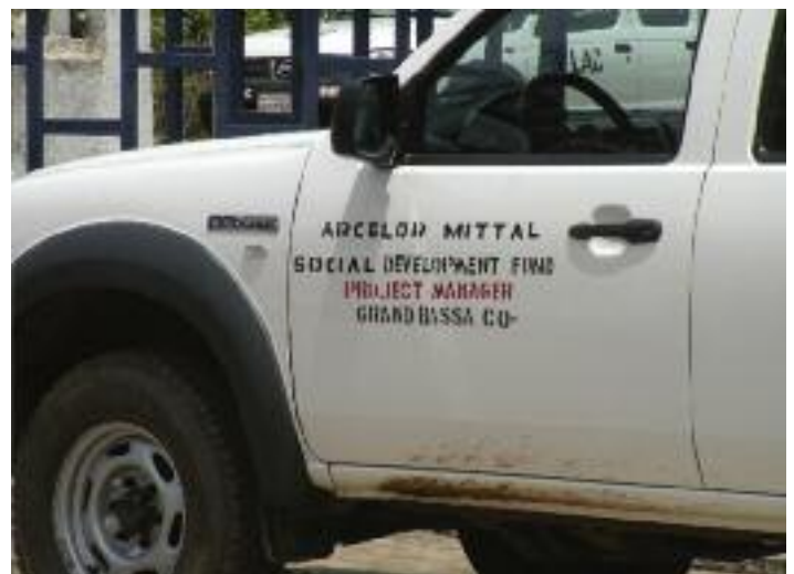
Pick up truck used by CSDF Project Manager in Grand Bassa