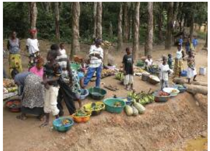
Road market, Nimba County

GAAM is very seriously concerned with the lack of EPA capacity to monitor the iron ore investments in Liberia. This problem will only increase when ArcelorMittal and other companies start full operations. The EPA has also indicated to GAAM that it lacks well-developed standards for monitoring of certain activities not to mention the tools to conduct this monitoring. This issue needs to be urgently addressed by the government of Liberia.