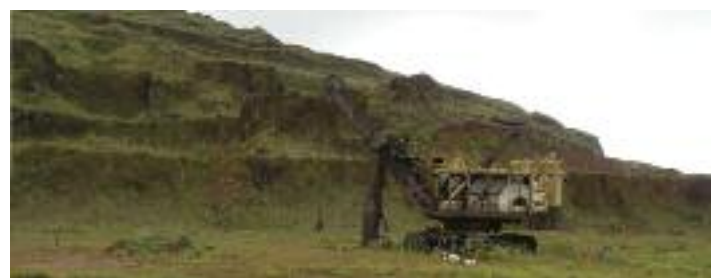
Old mining excavator in Tokadeh Mine, Nimba Mountains