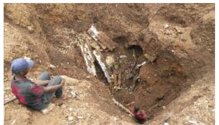
Scrap diggers

ArcelorMittal could arrange for rehabilitation of the dumpsite area, not only because of its proximity to people's houses but also to show its commitment to a clean environment and to provide employment for local people using the company's engineering and safety know-how. ArcelorMittal could also use this opportunity to 'provide training for Liberian citizens for skilled, technical, administrative and managerial positions' as it is committed to by the MDA.