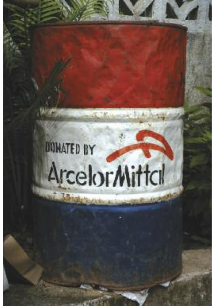
Donated by ArcelorMittal.

The issues arising from this review go to the heart of the ethical debates about whether it is better for the corporations to make voluntary social contributions or to pay taxes that are negotiated in a fair and transparent manner, during contract negotiations. For example, in the previous contract with the interim government of Liberia, ArcelorMittal enjoyed a tax holiday and was given control of major state assets. Ironically, it was in that contract that the idea of the Social Development Fund, which became a key selling point of the contract, was introduced. This contract was made void by the newly elected government, after international pressure, as the contract heavily favoured ArcelorMittal (This was prior to the merger with Arcelor).