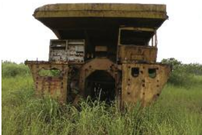
Damaged Lamco truck near Yekepa, Nimab County

ArcelorMittal will also be the third largest and most powerful private company in the country after BHP and China Union, so the pressure on it to deliver more in this respect is likely to escalate. Furthermore, as ArcelorMittal was the first company to invest in iron ore mining, its performance is likely to set the standard for the other mining companies.