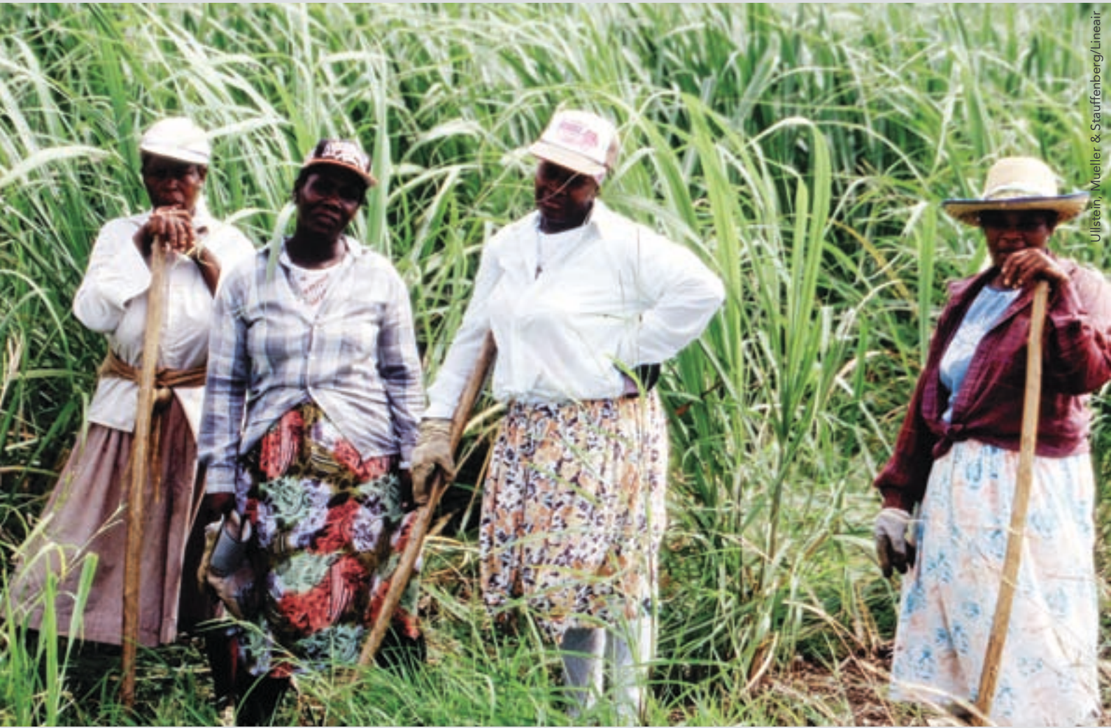
Sugarcane on Barbados.