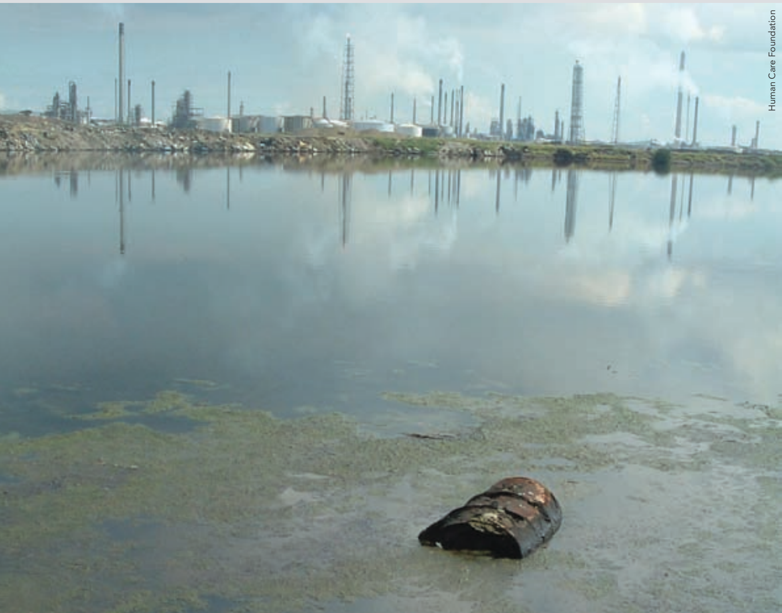
Polluted "lake Asphalt" on Curacao.