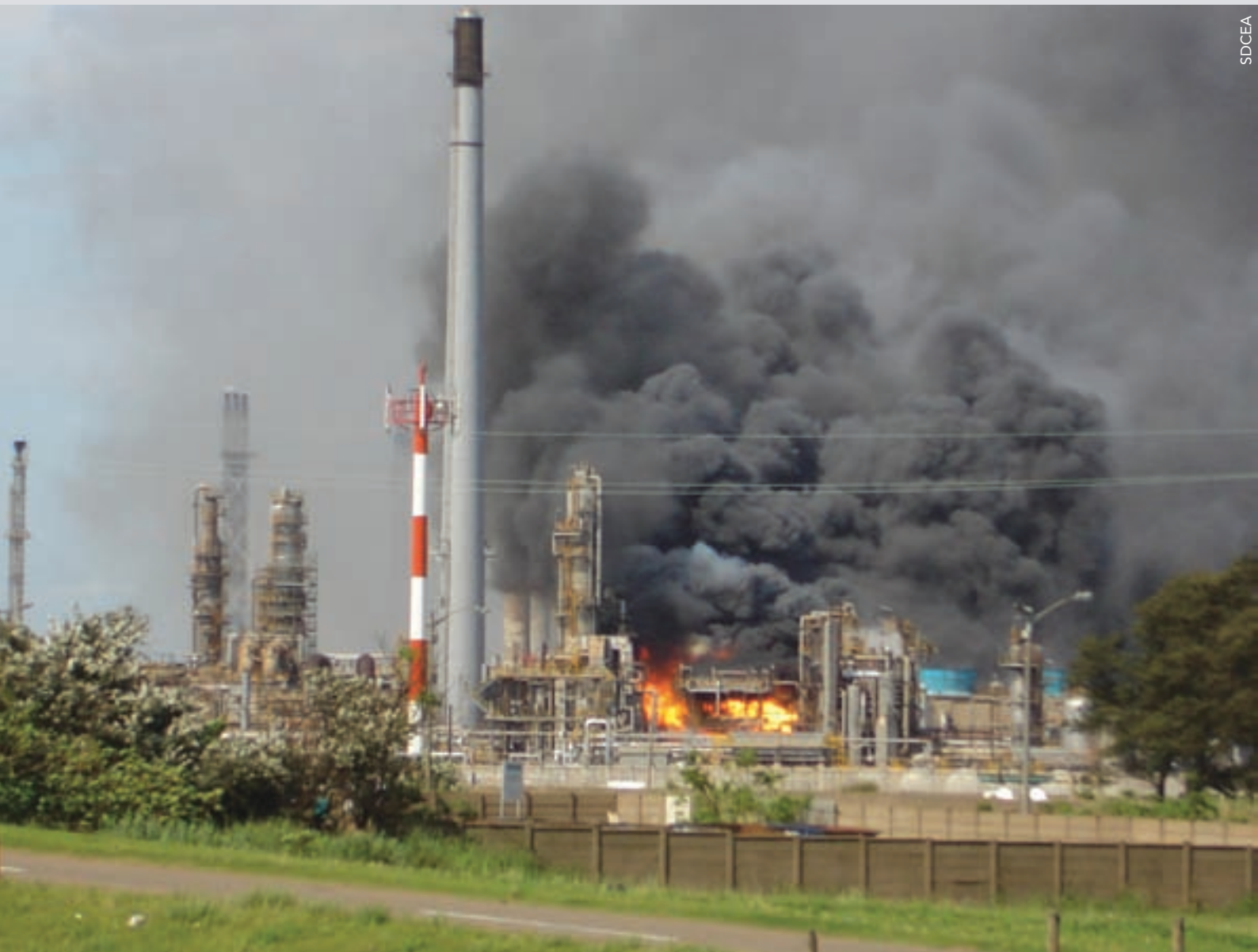
Fire at Sapref refinery in Durban, South Africa.