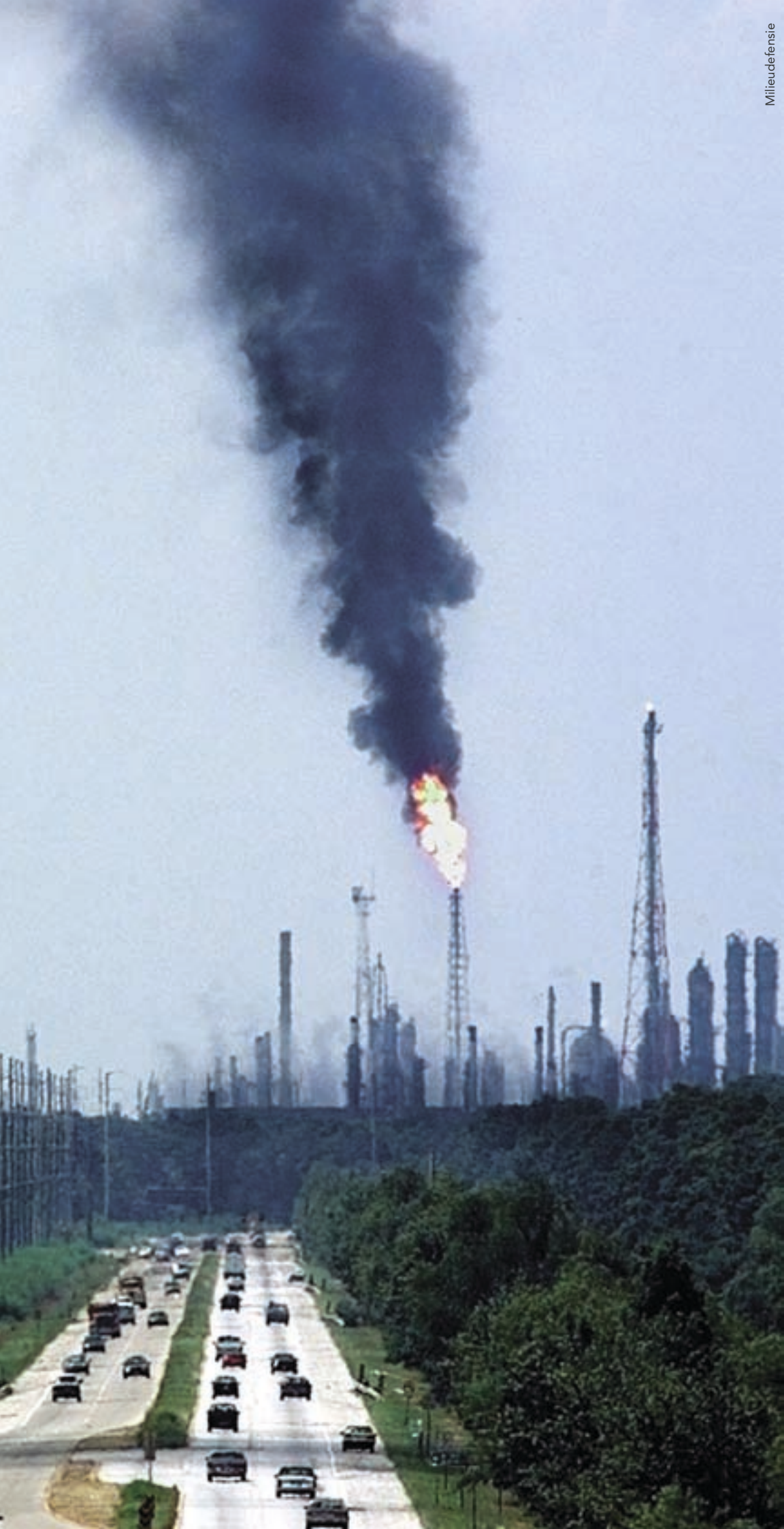
Gas flaring in Norco, Louisiana, USA