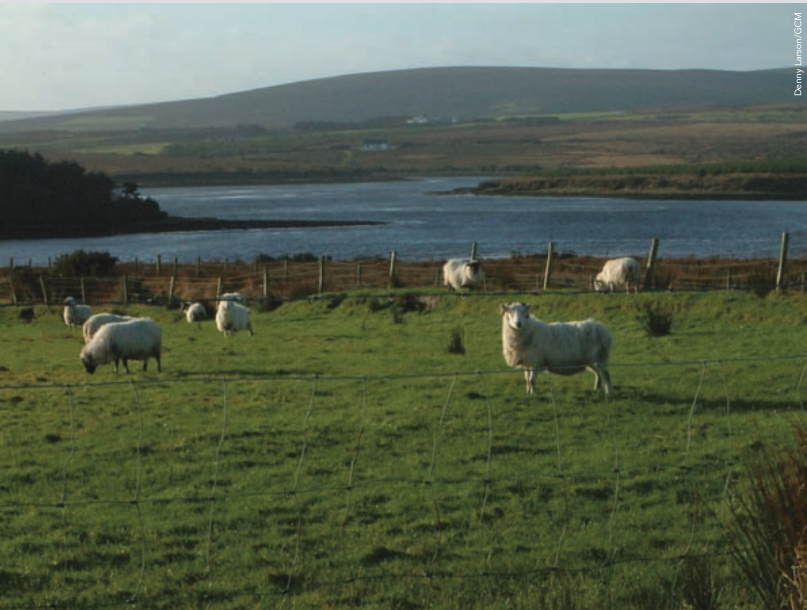
Farmland in Rosport, Ireland.