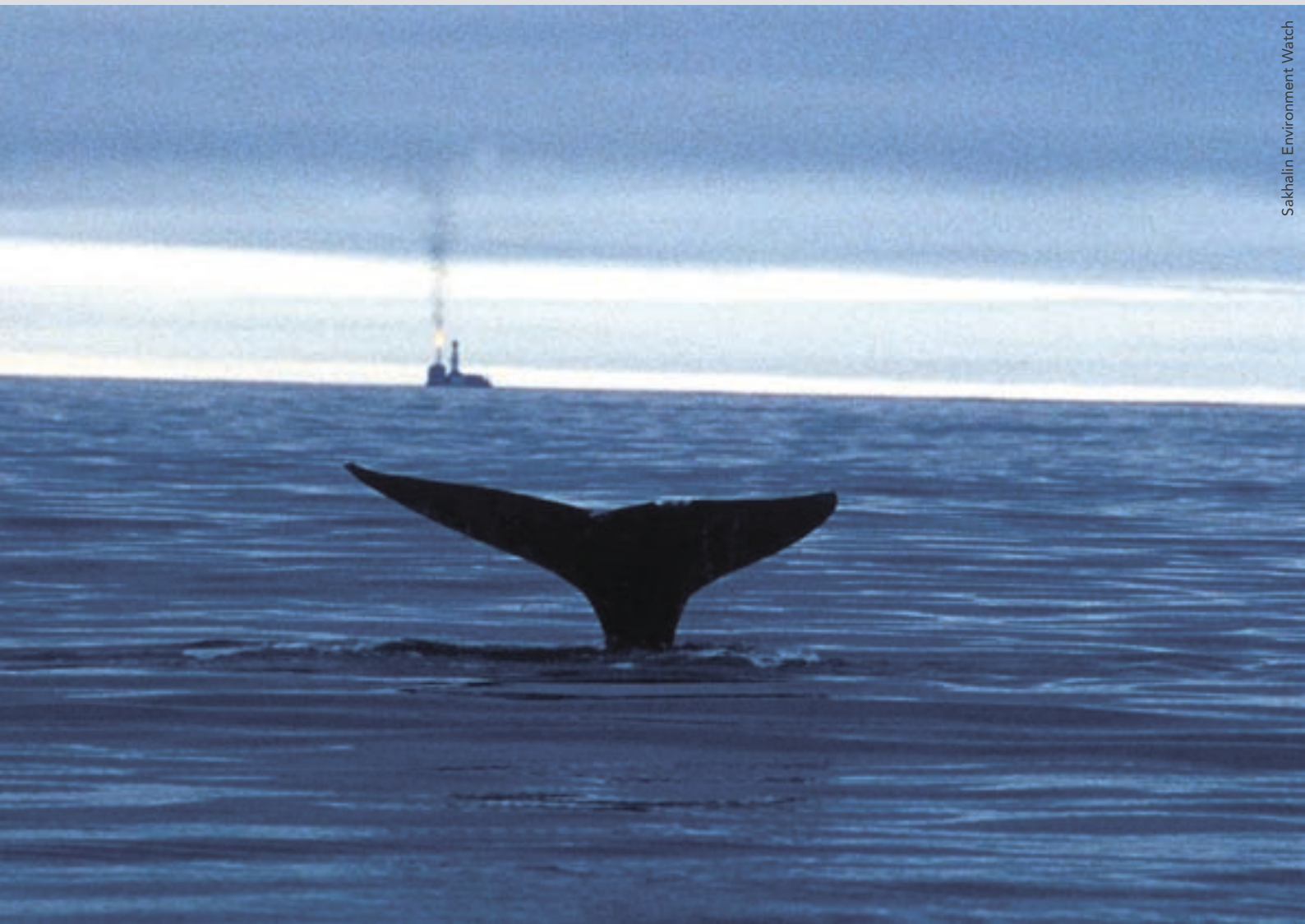
Pacific Gray whale, Sakhalin.