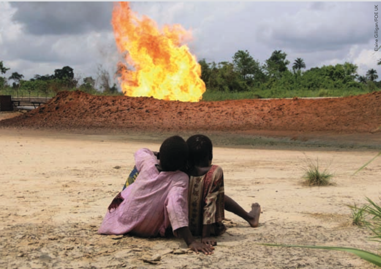
Children look at gas flaring in the Niger Delta, Nigeria.