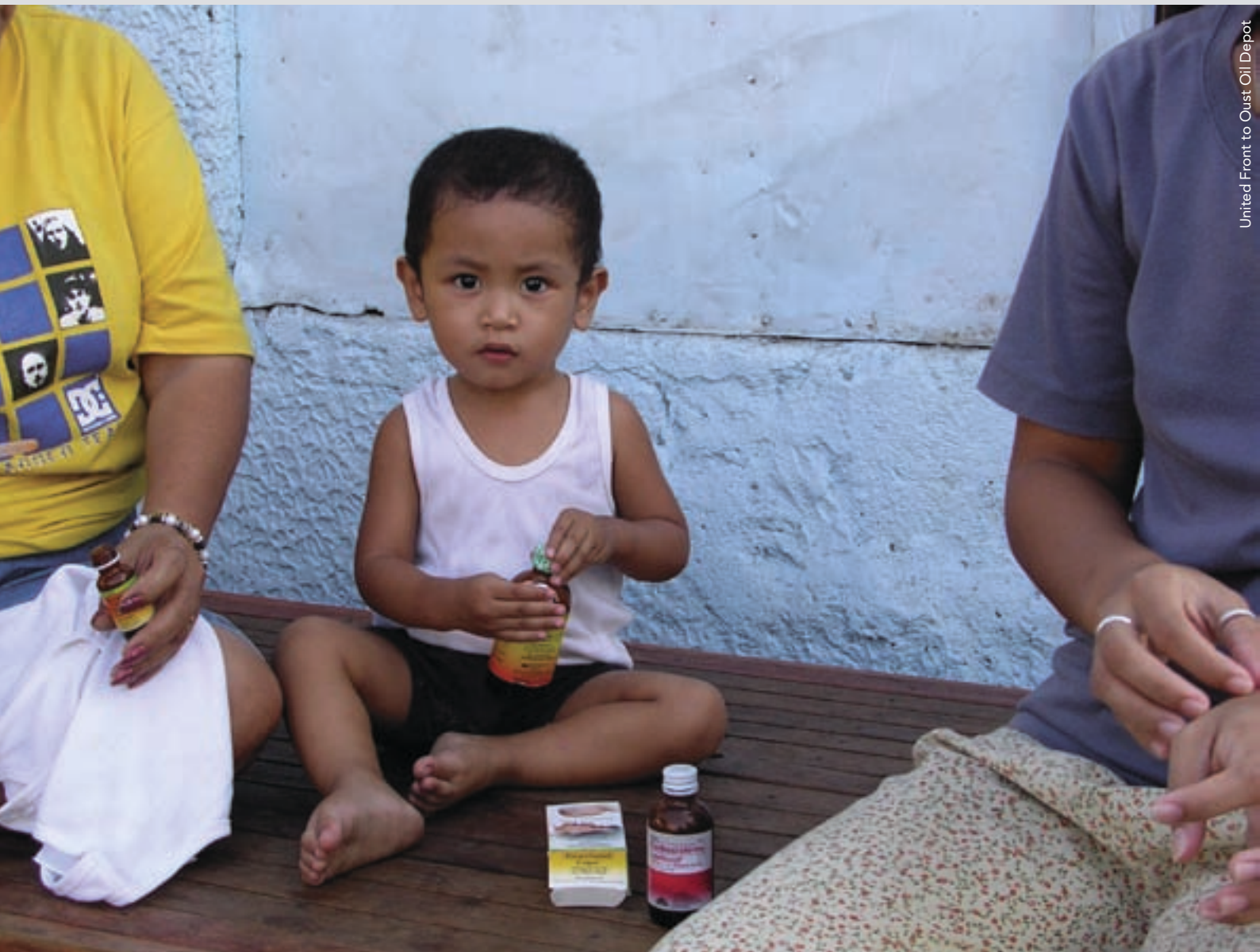
Child with medication, Philippines.