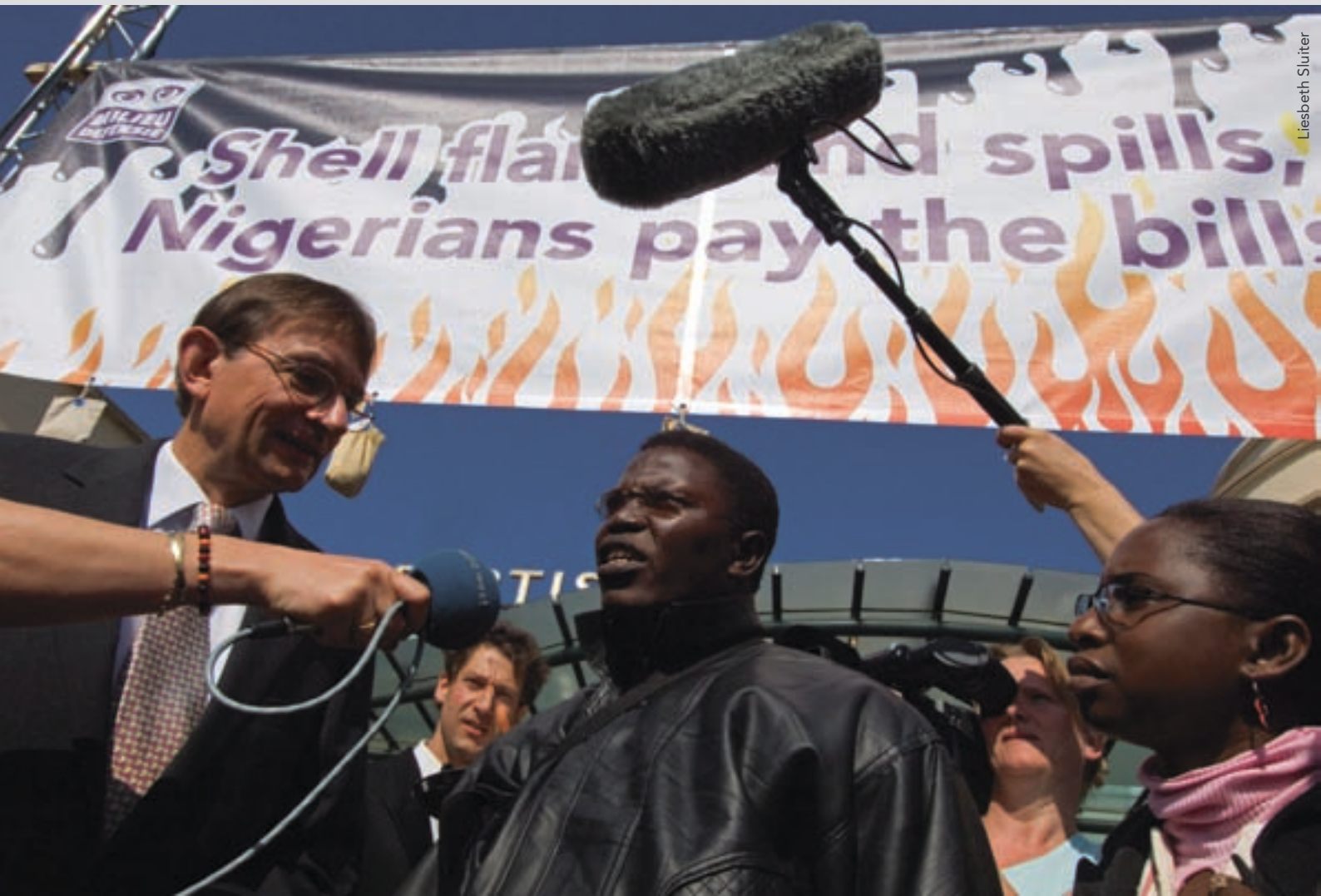
Action Milieudefensie at AGM Shell, May 2006.