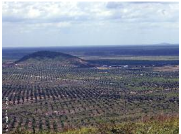
Palm oil plantation, Indonesia.