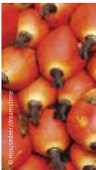
Below: Palm oil seeds. Right: Land being cleared for palm oil in Ketapang, Indonesia.

Sime Darby's expansion into Liberia is part of the company's ambition to reach 1 million hectares of plantation land in the next five years. 21 This would very nearly double its current palm oil plantations area and would inevitably involve large scale deforestation to create new land. Sime Darby is not alone. Other RSPO companies with some certified plantations, for example IOI and Cargill, are also expanding their operations into new land including forest.