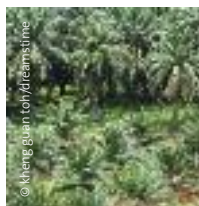
Palm oil plantation.

New demand for palm oil for biofuels is already leading companies, such as Sime Darby, to chop down forest to create new plantations.