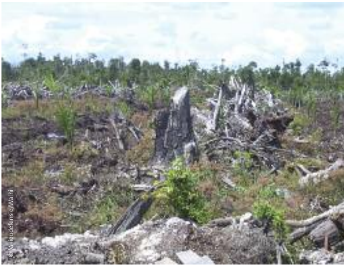
Peat land forest cleared for oil palm expansion in Ketapang, Indonesia.

As Sime Darby's certified plantations start supplying palm oil for biofuel instead of for other products, new plantations need to be established to maintain the supply for the other products. The EU biofuels market and other new palm oil demands are driving Sime Darby's expansion into tropical rainforest in Indonesia and Liberia.